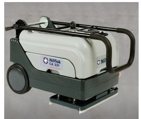
Folded handle makes transportation from job to job easy