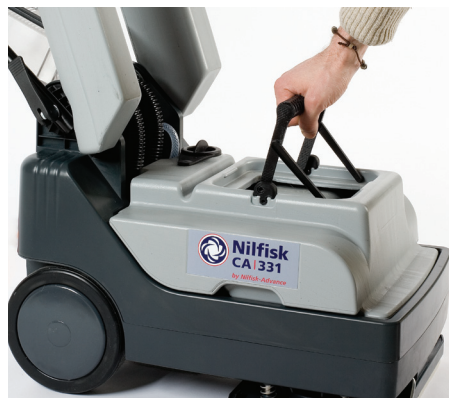
The recovery tank can be tilted for easy cleaning and better access to batteries and detergent solution