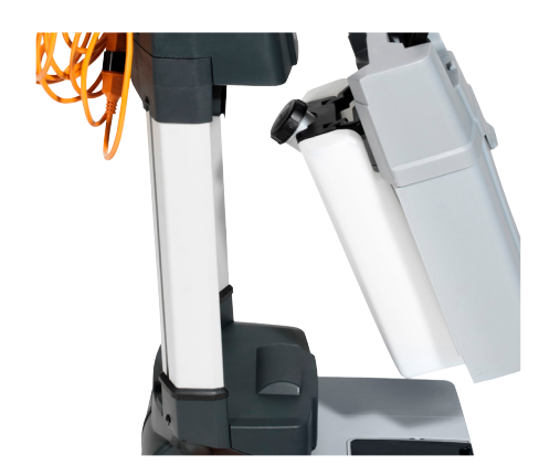
Each tank can be removed quickly and carried in one hand.