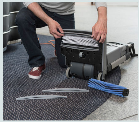
Apart from getting faster cleaning of hard floors, you will also be able to freshen up smaller carpets, including removal of spots, by adding an optional carpet kit. Brush and squeegees can be removed without any tool making daily maintance operations easy and fast