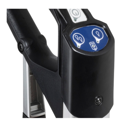
You will remain in full control of the scrubber dryer thanks to the intuitive touch display with two water settings and a solution indicator, alerting you if the tank is empty