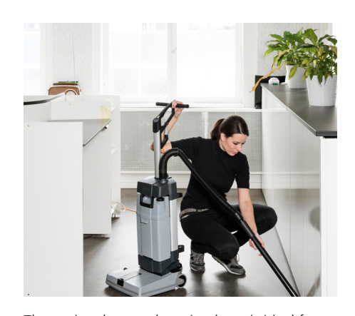
The optional manual suction hose is ideal for cleaning any unreachable area or spot cleaning.