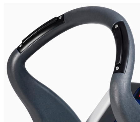
You have a safety switch practically placed on the handle for your convenience