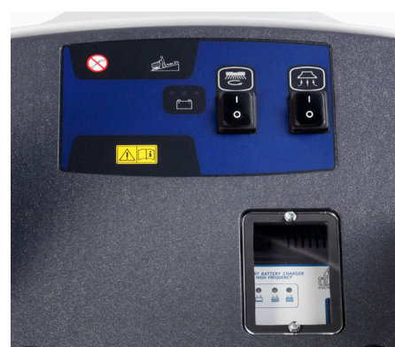
As easy as can be: You can effortlessly operate the SC450 by two buttons and a switch only