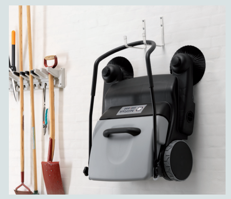
Clever handle/hopper construction keeps the hopper in place even when stored in the upright position or hung on a wall