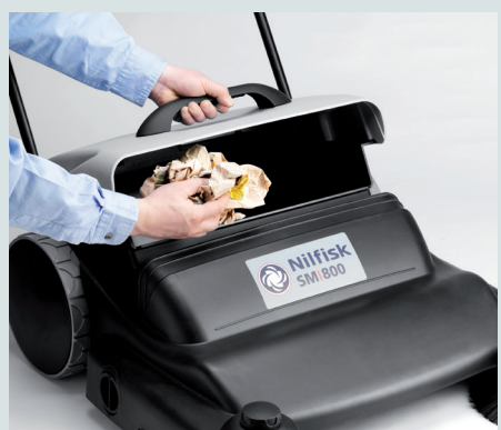
The hopper can stay in open position so it is easy to throw big items or empty a garbage bin into the hopper