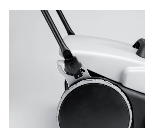
The handle can be adjusted to fit the operator height (3 positions)