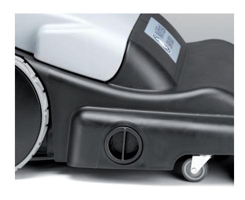
Main broom can be adjusted in 4 different positions without the use of tools.