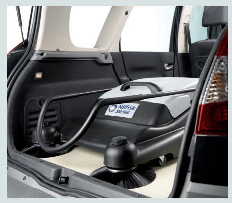
The handle can be folded without tools for storage and easy transportation