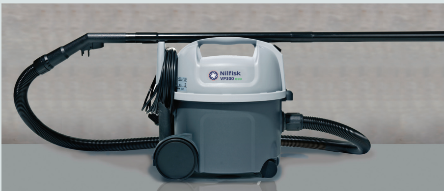
VP300 can be carried safely and comfortably in one hand