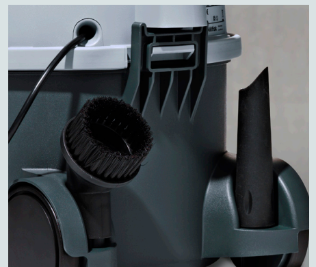
Discreet storage for nozzles allow all the tools you need to be within easy reach at all times