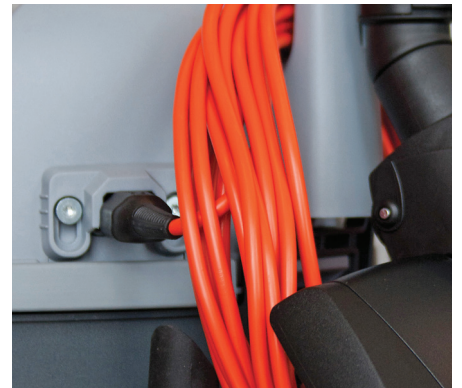
Detachable orange cord (VP300 HEPA)