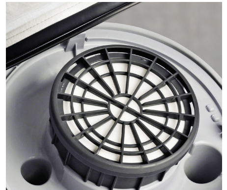
Higher filtration level with HEPA filter (VP300 HEPA)