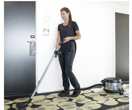
The new GD 930Q is specially built for noise sensitive areas with a low comforting background sound pressure level of only 42 dB(A)