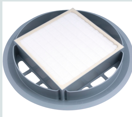
HEPA H13 filter capable of capturing 99.997% of particles down to 0.3 microns