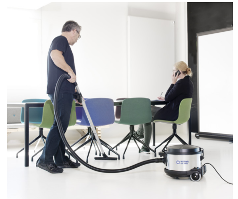
The GD 930 is the perfect choice for demanding applications such as offices, hotels and public buildings