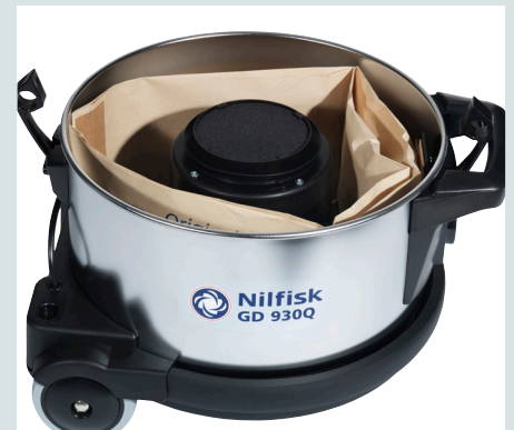
Durable steel container and 15 litre dust bag