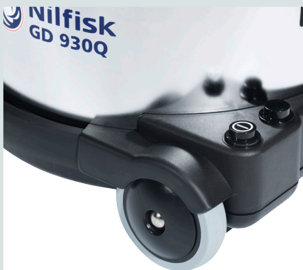
Dual speed function