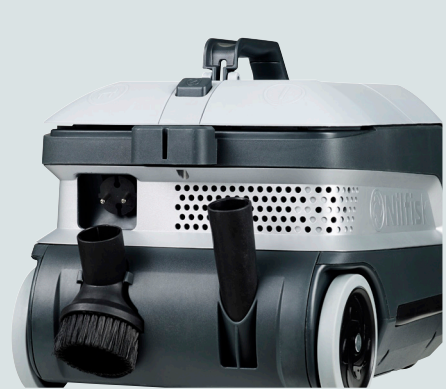
User friendly and easy to reach accessories