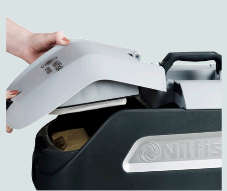
Magnetic hinges securing high reliability