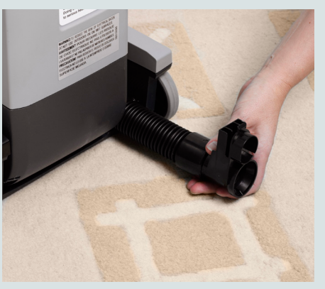
Easy access to suction hose for removal of any blockages that may arise