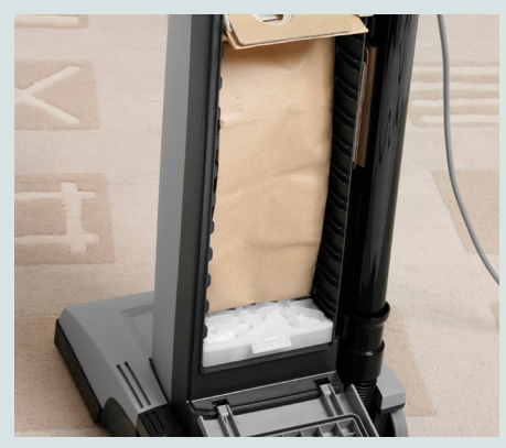
The dust bag is 'universally' sized and is easy to interchange