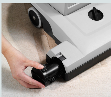
The brush is easily accessed without the need for tools for easy replacement, maintenance and cleaning