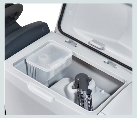
Productive: 45/45 liter water tanks and low energy consumption providing up to 5 hours of running time