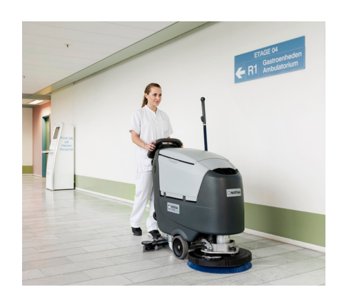
Ideal for daytime cleaning: Sound level reduced to just 60 \pm 3 dB(A) due to new low noise Vac motor system with silent mode setting.