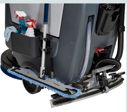
Utility box with integrated mop holder (optional).