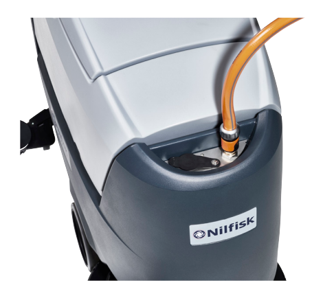
Water filling system with easy connection and automatic shut-off when tank is full (optional).