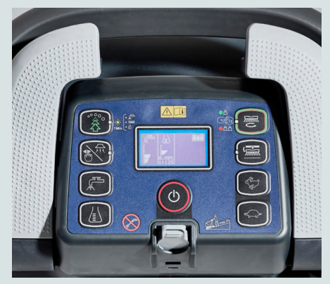
Informative digital display, intuitive icon buttons and new ergonomic drive paddle