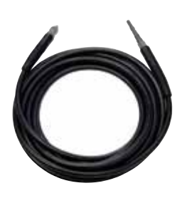
Drain cleaning kit Unblocking drains, toilets and pipes is childs' play with our easy to use drain cleaning kits

The Powerspeed Plus lance offers multiple benefi ts and effects. The rotary jet increases cleaning performance over larger surfaces. The pressure adjustment ensures that you can clean with high pressure but also rinse and apply detergent with one lance