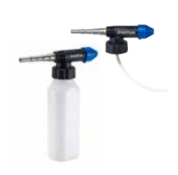
The FoamSprayer technology allows a simple and efficient application of detergent.