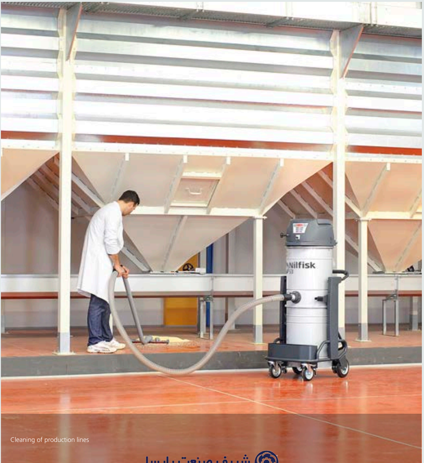
Cleaning of production lines