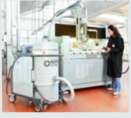
Recovery of shavings from marble carving