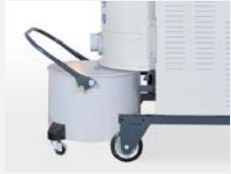
Container release system