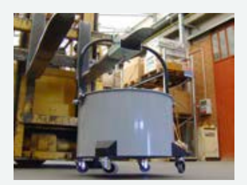
Container transport and discharge system with lift truck