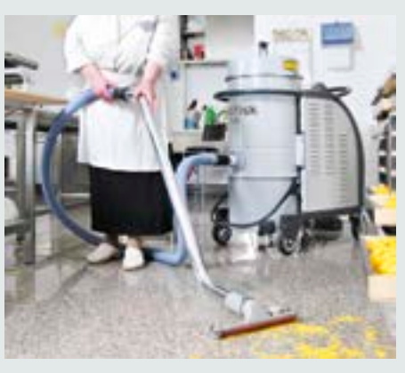
Collection of pasta, flour and sugar