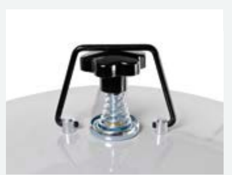
Manual filter shaker