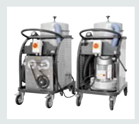
Turbine or lateral channel vacuum unit