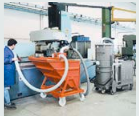
Metal sector: collection of shavings and oils