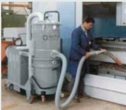
Metal sector: collection of shavings on machine tool