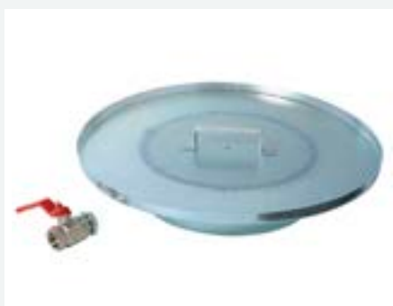
Grill and valve for separating solids from liquids inside the container