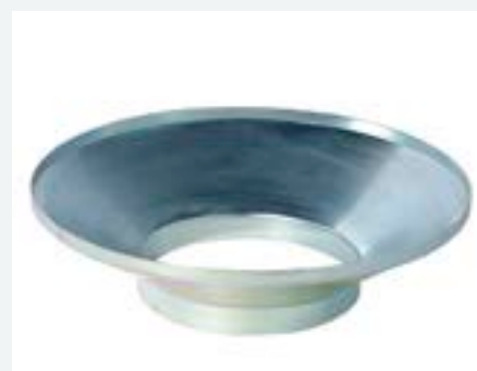
Removable cyclone that protects the primary filter from becoming in direct contact with incoming liquids or sharp objects