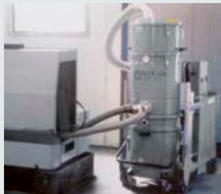
Fixed application for recovery of graphite