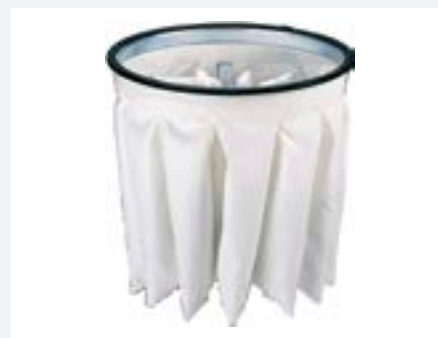
Standard star filter