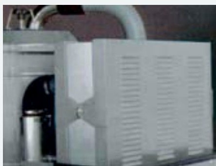
Absolute exhaust air filter