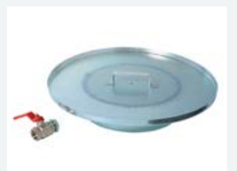
Grill and valve for separating solids from liquids inside the container