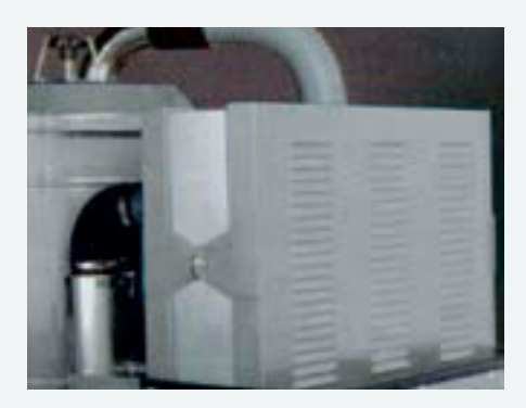
Absolute exhaust air filter