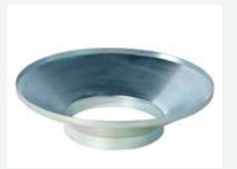
Removable cyclone that protects the primary filter from becoming in direct contact with incoming liquids or sharp objects