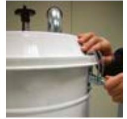
Easy maintenance/replacement of the filter