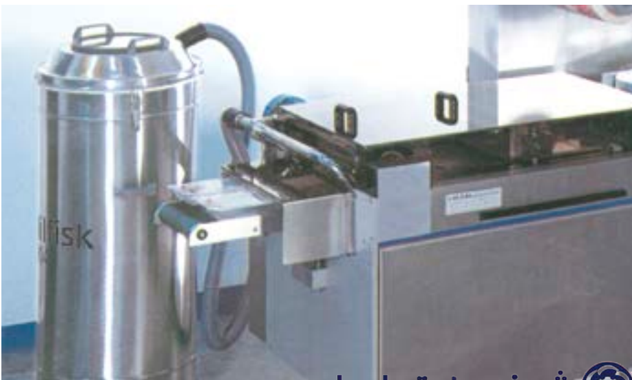
Collection of trims from packaging machine.