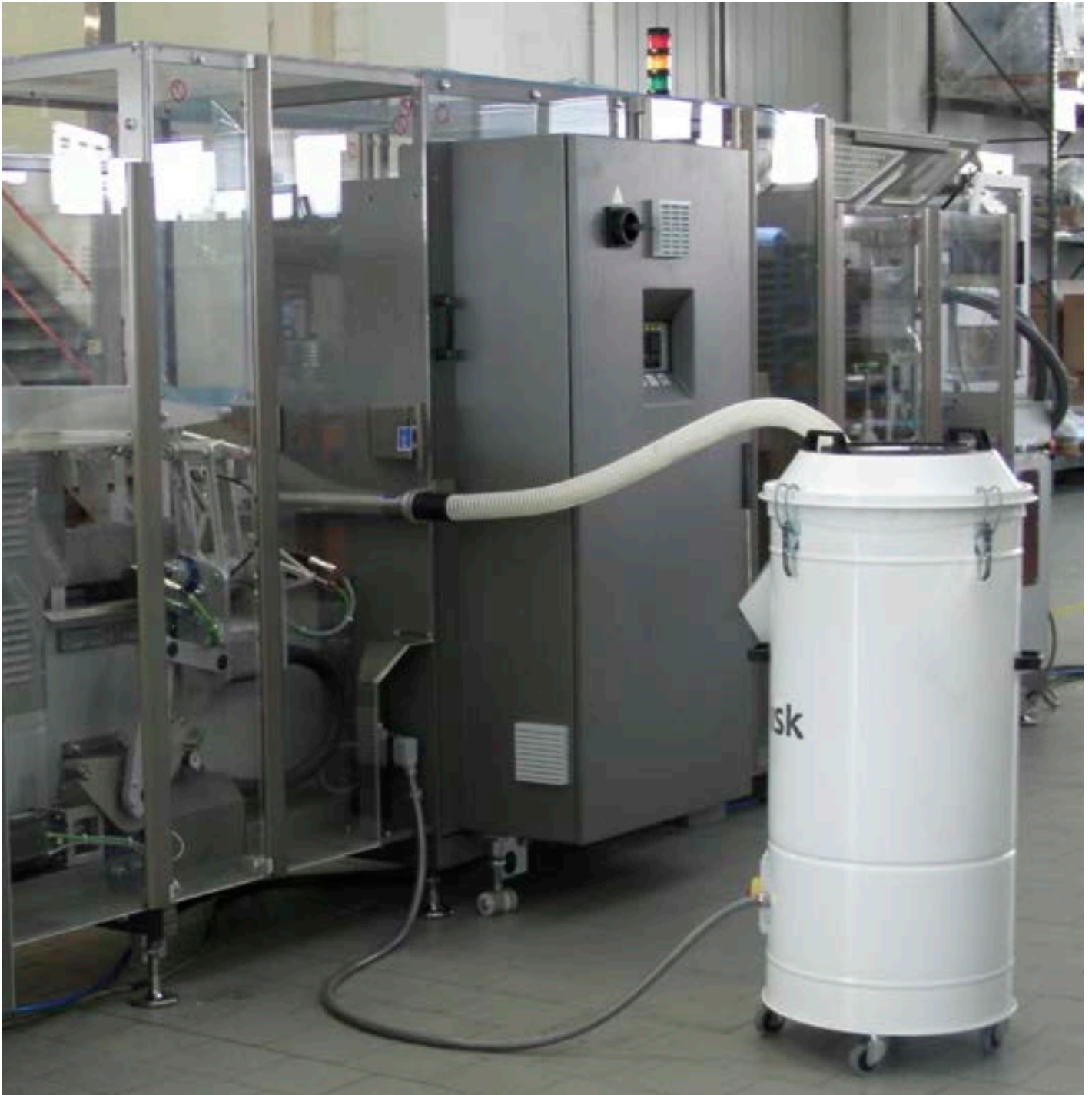
R model on a packaging machine.