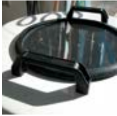
Window to control the trims level