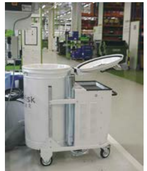
Power and capacity in a trim-extractor.