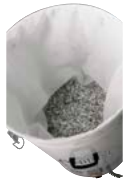
Trims inside the container