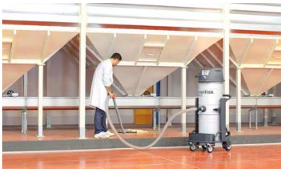
Cleaning of production lines.

Lifting system : an useful kit, consisting of support, belt and handles, allows to move the vacuum by a forklift or a bridge crane.