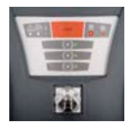
Electronic board control