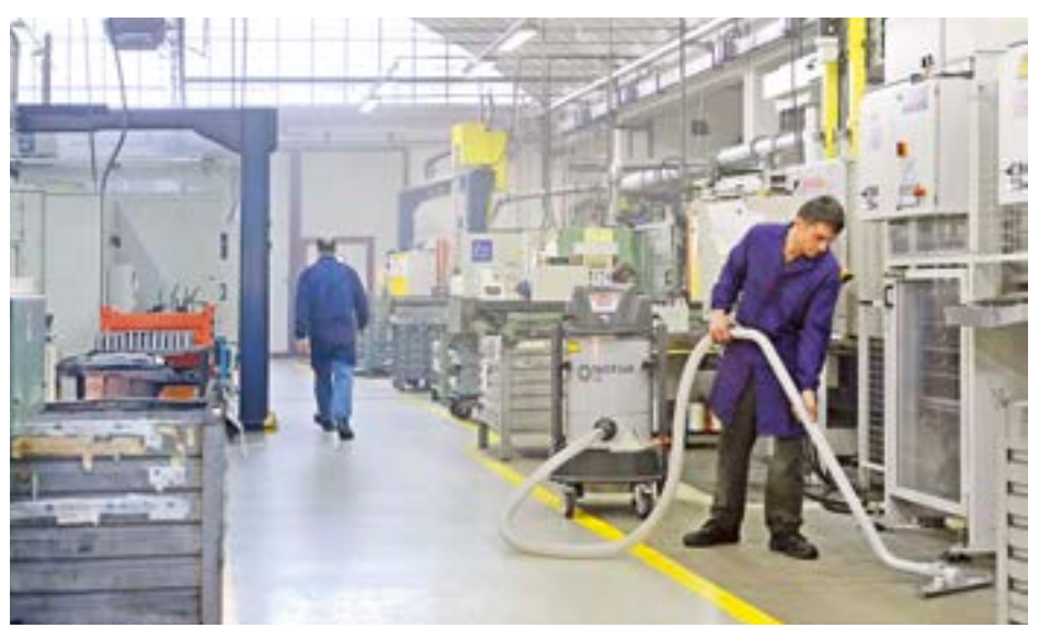
Cleaning of a metal company.