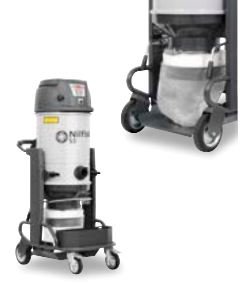
S3 with gravity unload system with Longopac®.