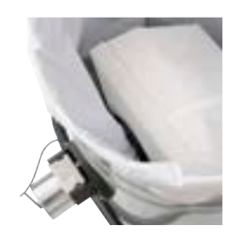
Safe bag for toxic material