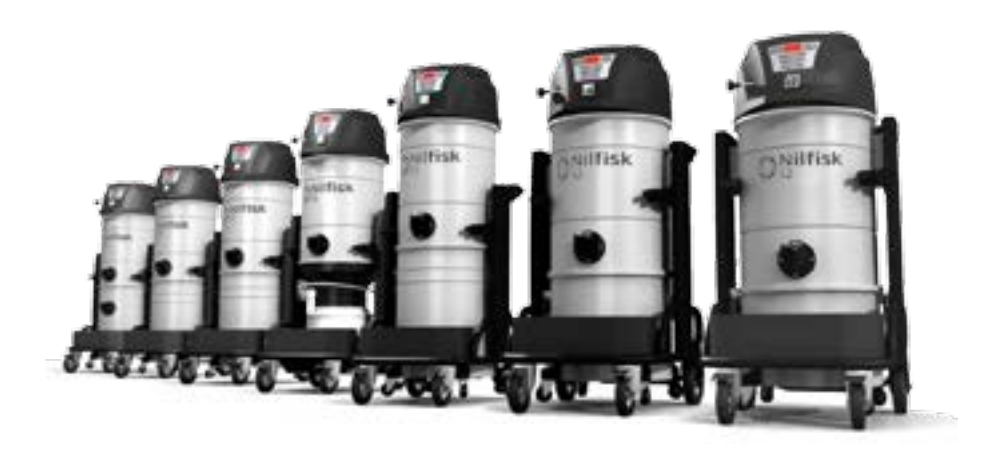
Fig. 3 Reliable and easy to use, here the singlephase industrial vacuums for your company ff

Available in more than 90 variants including the certified versions (TüV, L-M-H), the new S2 and S3 are the starting point of the future of industrial vacuum technology.