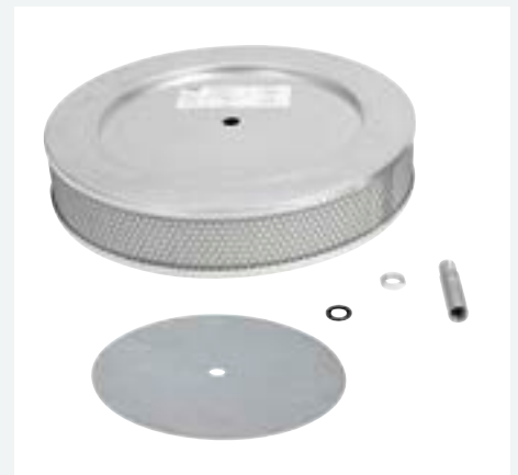
Optional HEPA filter