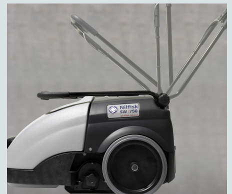
The handle is fully adjustable to suit each individual operator. It folds down completely to simplify storage.