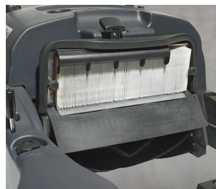
Thanks to the polyester filter the SW 750 can be used in both dry and humid areas.