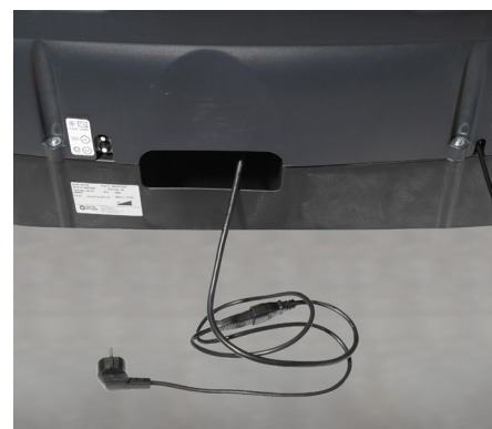
The plug-in onboard battery charger ensures continuous and hassle-free operation.