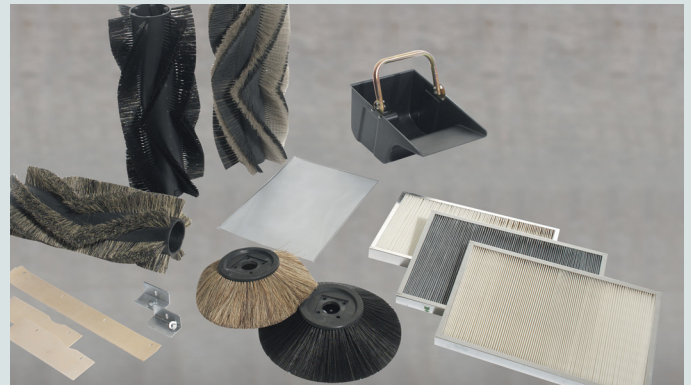
Large range of optional accessories provides the right tools for specific jobs e.g. carpet kit, special filters and brushes, overhead guard, 2x18 litres hopper containers etc.