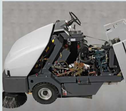
All major components are accessible quickly without the need for tools. Maintenance is fast and simple