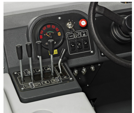
Easy to use operating controls mean more efficient cleaning