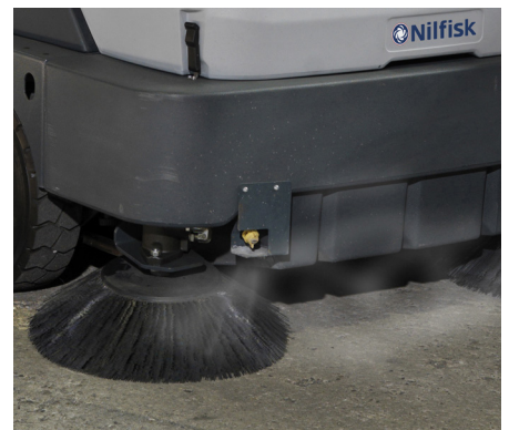
The exclusive DustGuard™ system effectively controls airborne dust by providing a fine mist of moisture to the front and side brushes