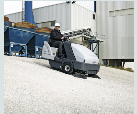
Ramp climbing ability - up to 25%