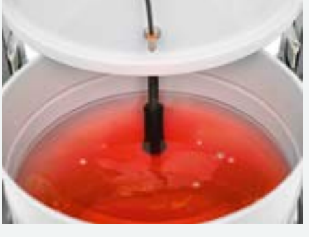
Liquid cut-off system